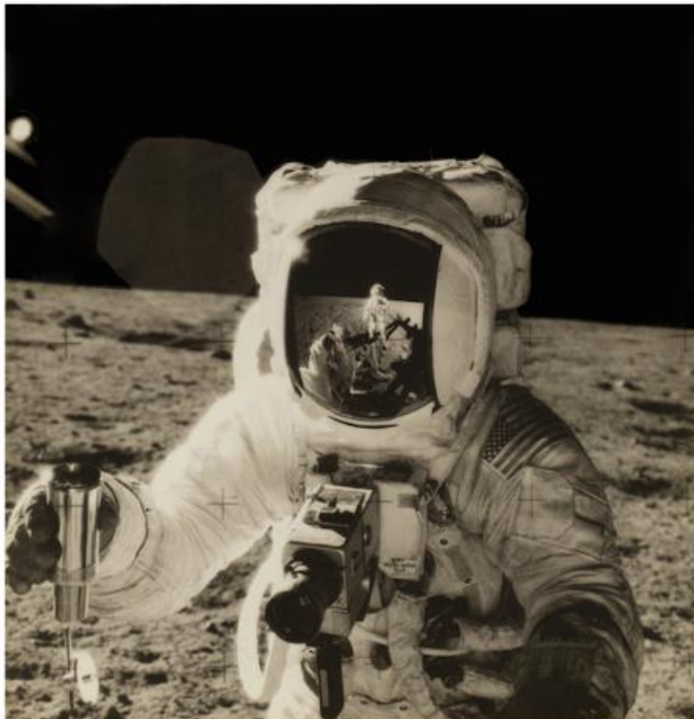
NASA Apollo 12 Charles Conrad "Alan Bean", November 19 (1969)

Michael Hoppen is showing a selection of photographs. Ranging from works by Henri Cartier-Bresson to Richard Avedon and Tim Walker, the images vary from street photography to classic fashion imagery.