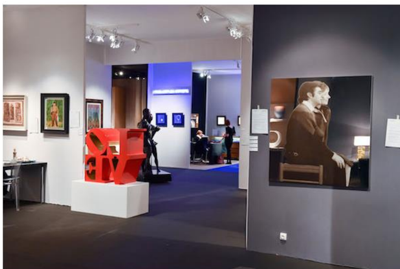
Installation view of Galleria Tega

Pierre Passebon also received an award, winning "best stand" alongside Rose Uniacke. Passebon prides himself on arranging unusual combinations of furniture and art from different eras. The winning stand included Paavo Tynell and design legend Frances Elkins .