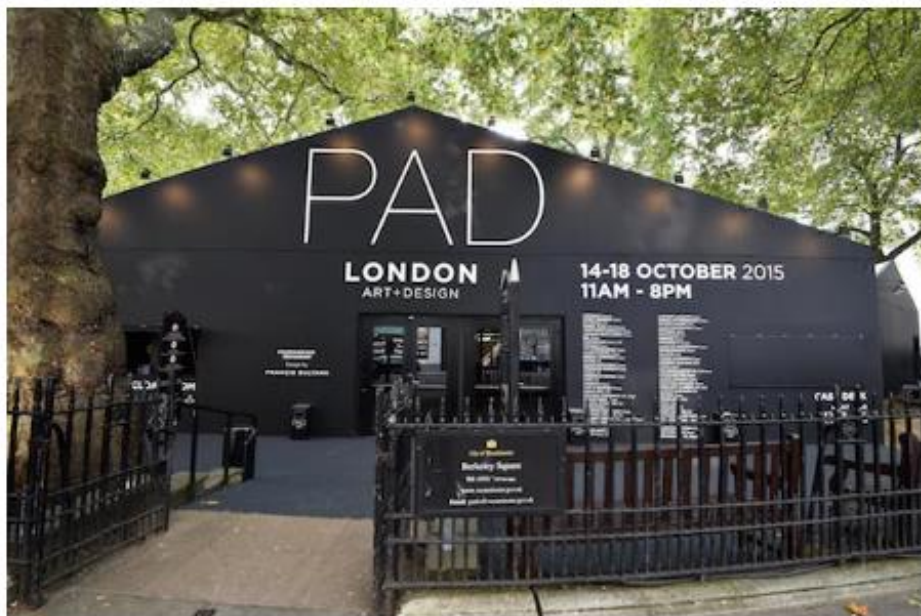
PAD is situated in Berkeley Square in Mayfair

PAD London Art + Design opened for VIPs on Wednesday, with the usually high standard of fine art, furniture, and design. The plush venue, a luxury tent in Berkeley Square that incorporates the beautiful trees in the park as part of the stands, seeks to inspire visitors to collect with the eclectic range of luxury items on sale.