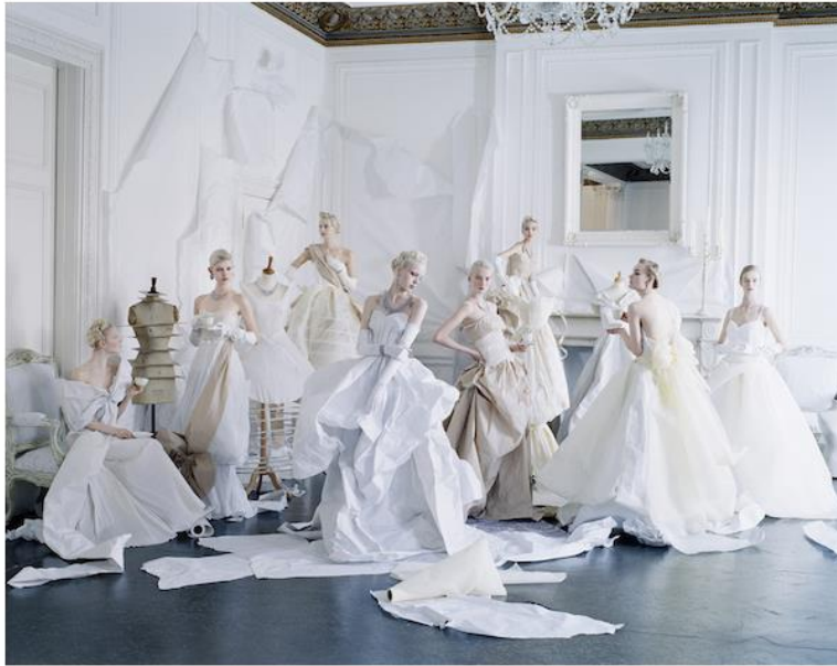
Tim Walker Eight models in paper dresses after Cecil Beaton's image of debutantes in Charles James London, UK, (2012)

Tega are showing an array of European artists including Alberto Burri, Lucio Fontana , Michelangelo Pistoletto, and some drawings by Pablo Picasso . There is also a Keith Haring vase which is well worth a look.