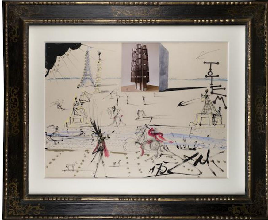
Salvador Dalí Totem. Medidas con marco

The stand was painted a deep blue which perfectly enhanced the color of the furniture, highlighted with tasteful lighting.