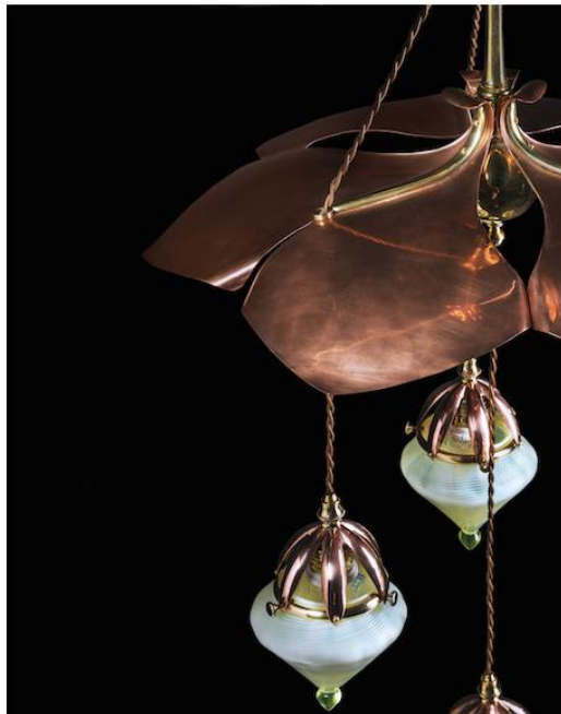
William Arthur Smith Benson Four-light chandelier (c. 1898)

Joining in with the celebration of Modern Italian art happening at the moment, Robilant & Voena are showing some stunning examples of work by Burri, Fontana, and Paolo Scheggi.