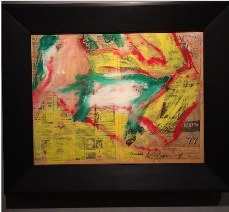
Willem de Kooning Untitled (1972)